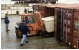
Stuff container with cargo