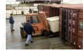
Unstuff container with cargo