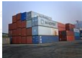
Deliver Full container