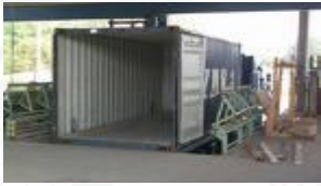
Request Empty Container