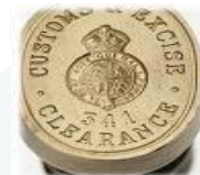
Customs Import Clearance