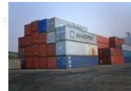
Receive Full container