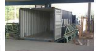
Return Empty Container