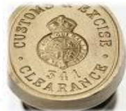
Customs Export Clearance