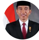
Joko Widodo President of Indonesia

Secured engagement and buy in from highest levels of government