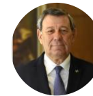
Rodolfo Nin Novoa Chancellor of Uruguay