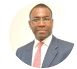
Amadou Hott Minister of Economy of Senegal